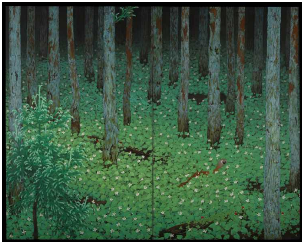
Weasel and Wild Strawberries by Katayama Bokuyo